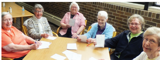
Sister volunteer crew at Humility of Mary Center

The Congregation of the Humility of Mary is grateful for the donations received in honor and memory of loved ones between October and December 2016.