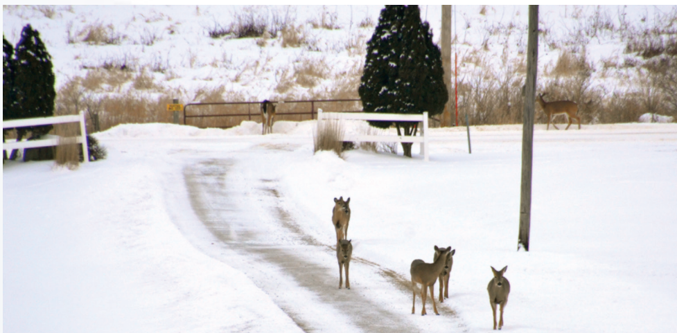
Guests arriving at the main entrance come to enjoy the peace and quiet of Our Lady of the Prairie Retreat.