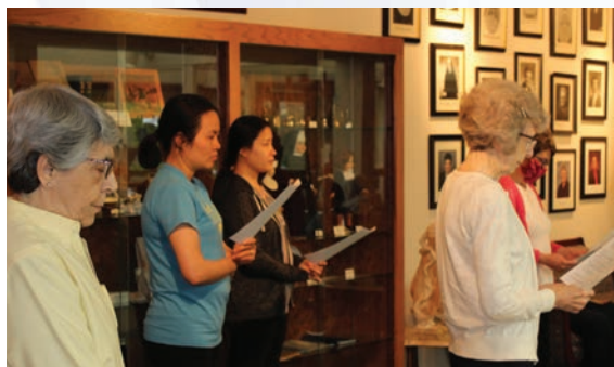
Sisters hold special prayer services in the heritage area at Humility of Mary Center in Davenport.