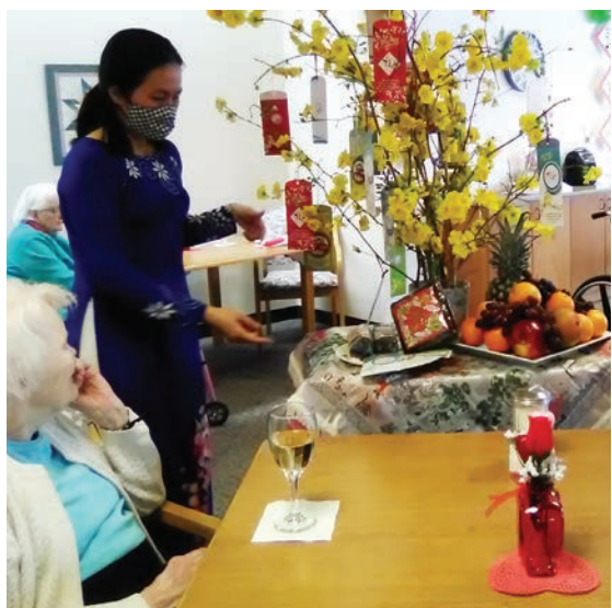
Four sisters residing at Humility of Mary Center, who are members of the Lovers of the Holy Cross based in Vietnam, celebrated with CHM Sisters the Lunar New Year with traditional Vietnamese customs, food and dance.

These relationships demonstrate that the bonds we have established through our ministries have been a blessing to not only those we have served, but also to the CHMs as we continue our legacy.