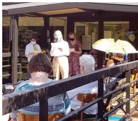
The Congregation of the Humility of Mary held a masked and socially distanced welcoming ceremony outdoors and on Zoom for four new associates in August 2020. Welcome to you all!