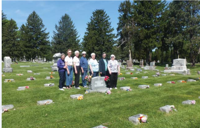
In Davenport for every Memorial Day, sisters, associates and friends hold a prayer service and place flowers at the graves of the sisters who came before them.