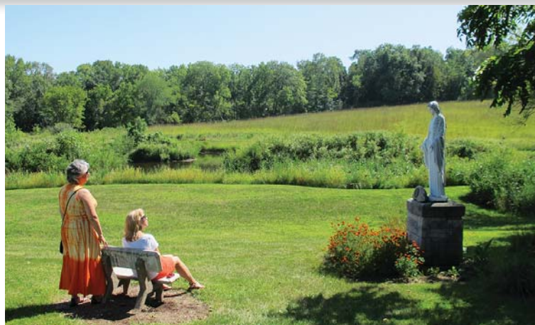
A moment of reflection at Our Lady of the Prairie Retreat

As Pope Francis invites, become agents of mercy for Earth: Retreat into the Universe Story, Songs of the Universe Concert and Retreat. Sometimes just