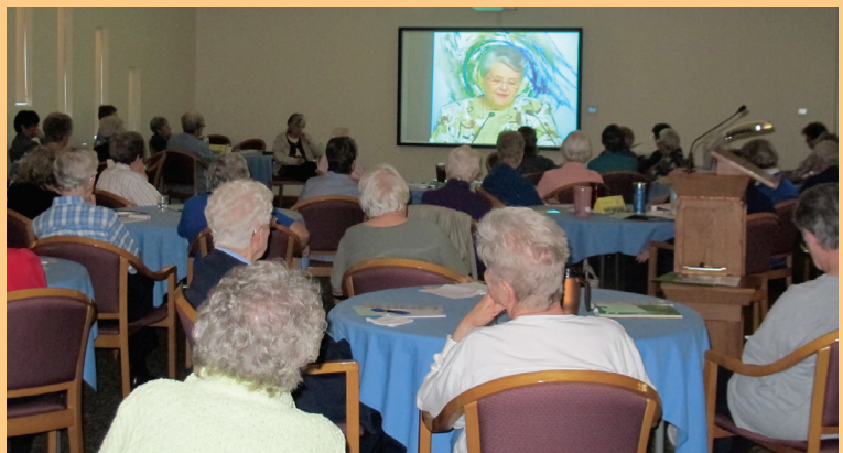
An anonymous donor provided for a video projection system in the Magnificat Chapel at Humility of Mary Center.