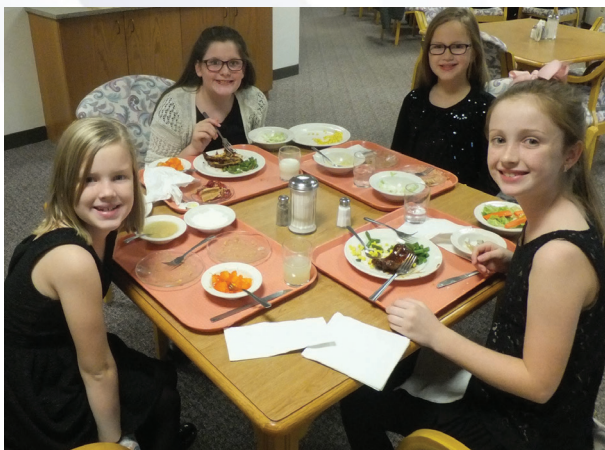
Friends and family of departed CHM sisters gather at Humility of Mary Center for Mass and social time.