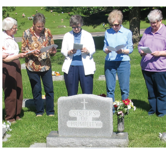
CHMS pray for their sisters on Memorial Day