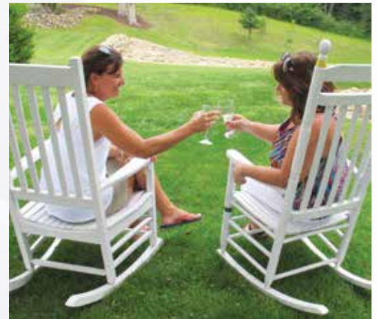
Guests enjoying the Spirit of the Prairie event at Our Lady of the Prairie Retreat.

committed to serving meals using naturally-raised healthy foods. Our garden grows many of the vegetables used in our meals, and our greenhouse was built in 2014 to provide fresh greens throughout the year.