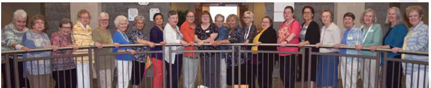
During the CHM Annual Assembly in June, associates gather for a day of reflection and fun.

Tributes to our departed sisters can be found at www.chmiowa.org in the Sister Stories section